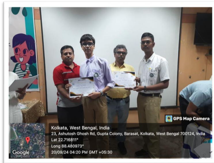
Award Giving Ceremony