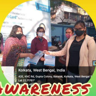
Kolkata, West Bengal, India 42E, KNC Rd, Gupta Colony, Barasat, Kolkata, West Bengal 700124, India Lat 22.717611° Long 88.480919° 20/12/21 02:27 PM