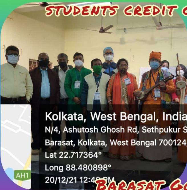
Kolkata, West Bengal, India N/4, Ashutosh Ghosh Rd, Sethpukur S Barasat, Kolkata, West Bengal 700124, Lat 22.717364° Long 88.480898° 20/12/21 12:46 PM