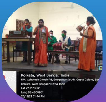
Kolkata, West Bengal, India N/4, Ashutosh Ghosh Rd, Sethpukur South, Gupta Colony, Barasat, Kolkata, West Bengal 700124, India Lat 22.717386° Long 88.480896° 20/12/21 01:44 PM