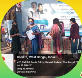
Kolkata, West Bengal, India 42E, KNC Rd, Gupta Colony, Barasat, Kolkata, West Bengal 700124, India Lat 22.717627° Long 88.480919° 20/12/21 02:27 PM