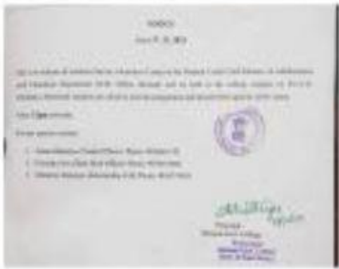
Awareness Camp on Students Credit Card (20/12/2021)