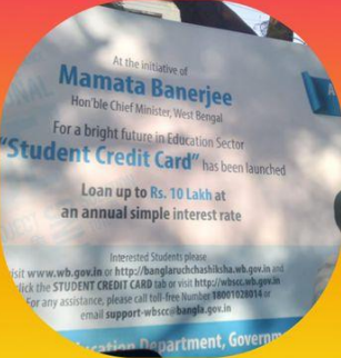
At the initiative of Mamata Banerjee Hon'ble Chief Minister, West Bengal For a bright future in Education Sector "Student Credit Card" has been launched Loan up to Rs. 10 Lakh at an annual simple interest rate Interested Students please visit www.wb.gov.in or http://banglarachchabachcha.wb.gov.in and click the STUDENT CREDIT CARD tab or visit http://wbcc.wb.gov.in For any assistance, please call toll free Number 8001028014 or email support-wbccc@bangla.gov.in Higher Education Department, Government of West Bengal