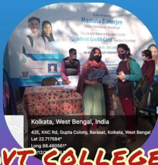
Kolkata, West Bengal, India 42E, KNC Rd, Gupta Colony, Barasat, Kolkata, West Bengal 700124, India Lat 22.717584° Long 88.480951° 20/12/21 01:44 PM