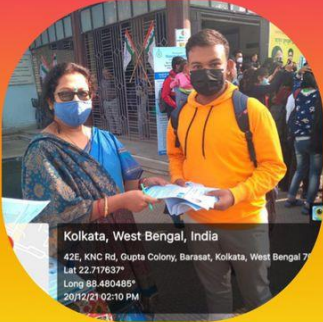
Kolkata, West Bengal, India 42E, KNC Rd, Gupta Colony, Barasat, Kolkata, West Bengal 700124, India Lat 22.717637° Long 88.480486° 20/12/21 02:10 PM