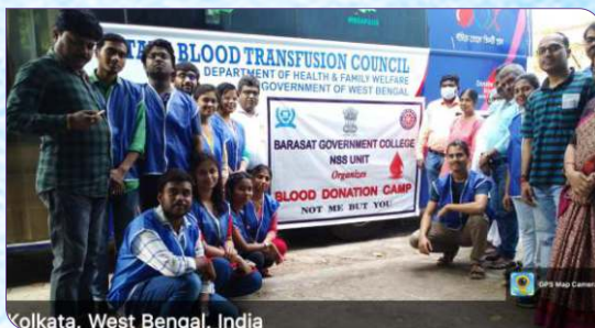
Kolkata, West Bengal, India