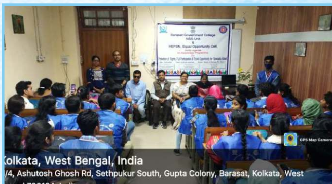
Kolkata, West Bengal, India

N/4, Ashutosh Ghosh Rd, Sethpukur South, Gupta Colony, Barasat, Kolkata, West Bengal 700124, India