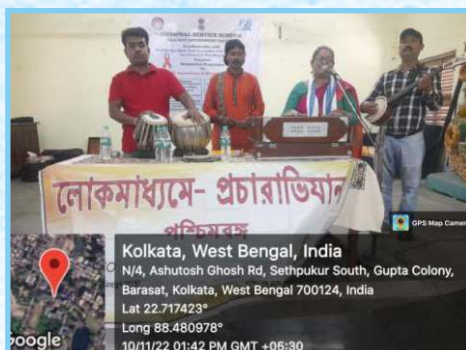
Kolkata, West Bengal, India N/4, Ashutosh Ghosh Rd, Sethpukur South, Gupta Colony, Barasat, Kolkata, West Bengal 700124, India Lat 22.717423° Long 88.480978° 10/11/22 01:42 PM GMT +05:30