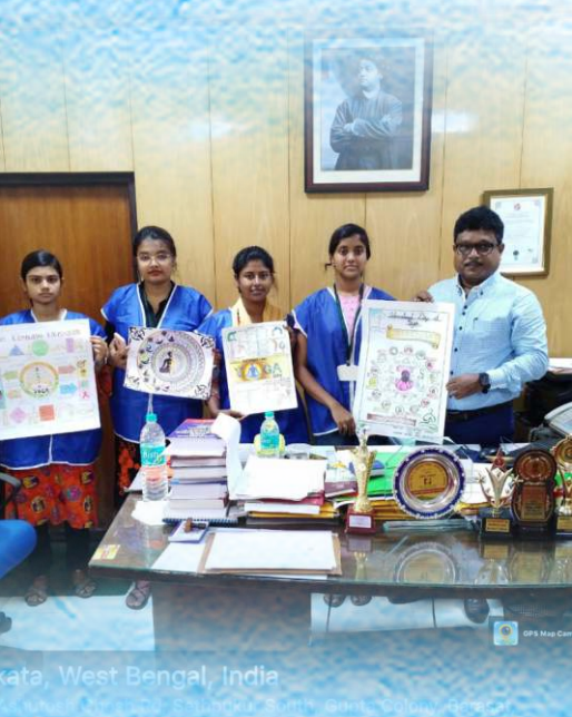
Kolkata, West Bengal, India

NAAC Accredited Grade A, DST-FIST Awarded and ISO Certified