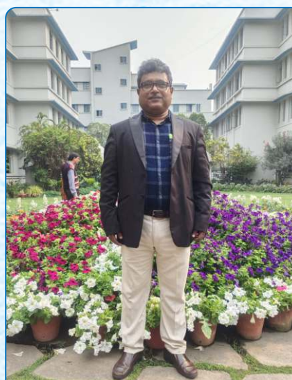
PRINCIPAL Barasat Government College

The college strives to pursue its vision to inculcate knowledge and power in the minds of the younger generation in order to participate in the development of the Nation, adding to its welfare, progress, and security. It also strives to achieve its mission of imparting holistic education and prepare students for national and global needs.