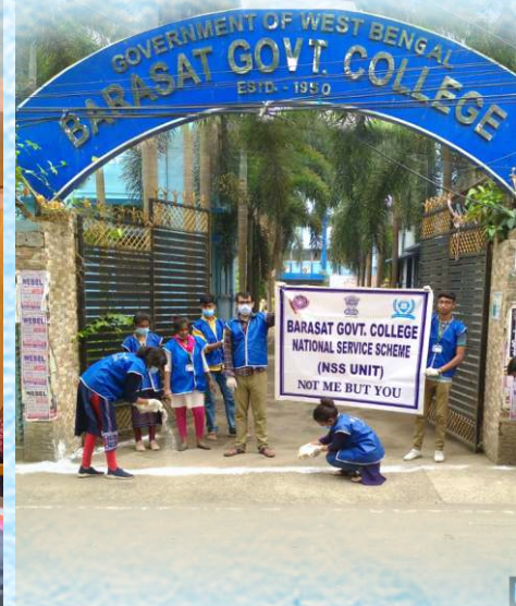
Kolkata, West Bengal, India