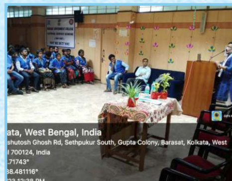
Kolkata, West Bengal, India

N/4, Ashutosh Ghosh Rd, Sethpukur South, Gupta Colony, Barasat, Kolkata, West Bengal 700124, India