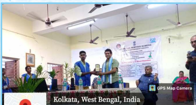
Kolkata, West Bengal, India