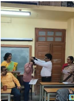
Kolkata, West Bengal, India 23, Ashutosh Ghosh Rd, Gupta Colony, Barasat, Kolkata, West Bengal 700124, India Lat 22.716841° Long 88.480705° 19/11/24 02:57 PM GMT +05:30