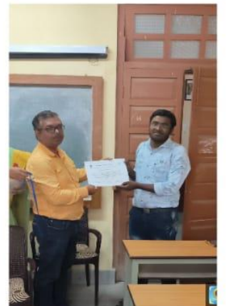
Kolkata, West Bengal, India 1, Ashutosh Ghosh Rd, Gupta Colony, Barasat, Kolkata, West Bengal 700124, India Lat 22.717425° Long 88.480788° 19/11/24 02:59 PM GMT +05:30