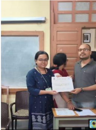
Kolkata, West Bengal, India 1, Ashutosh Ghosh Rd, Gupta Colony, Barasat, Kolkata, West Bengal 700124, India Lat 22.71744° Long 88.480833° 19/11/24 03:02 PM GMT +05:30