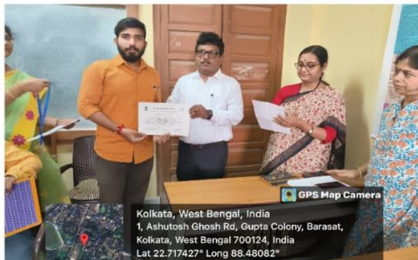
Kolkata, West Bengal, India 1, Ashutosh Ghosh Rd, Gupta Colony, Barasat, Kolkata, West Bengal 700124, India Lat 22.717427° Long 88.48082° 19/11/24 02:56 PM GMT +05:30