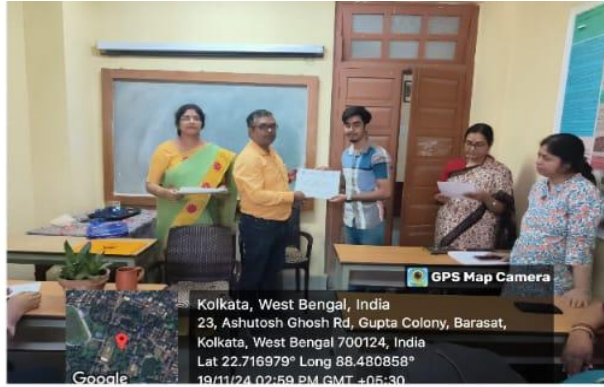
Kolkata, West Bengal, India 23, Ashutosh Ghosh Rd, Gupta Colony, Barasat, Kolkata, West Bengal 700124, India Lat 22.716979° Long 88.480858° 19/11/24 02:59 PM GMT +05:30