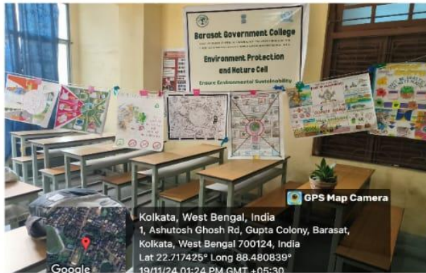
Kolkata, West Bengal, India 1, Ashutosh Ghosh Rd, Gupta Colony, Barasat, Kolkata, West Bengal 700124, India Lat 22.717425° Long 88.480839° 19/11/24 01:24 PM GMT +05:30