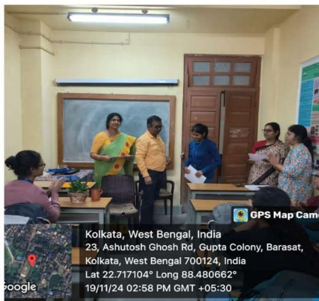
Kolkata, West Bengal, India 23, Ashutosh Ghosh Rd, Gupta Colony, Barasat, Kolkata, West Bengal 700124, India Lat 22.717104° Long 88.480662° 19/11/24 02:58 PM GMT +05:30