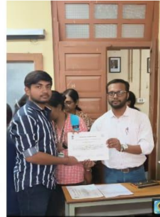
Kolkata, West Bengal, India 1, Ashutosh Ghosh Rd, Gupta Colony, Barasat, Kolkata, West Bengal 700124, India Lat 22.717423° Long 88.480819° 19/11/24 03:02 PM GMT +05:30