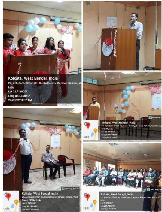
Glimpses of Sadbhavana Diwas Celebration